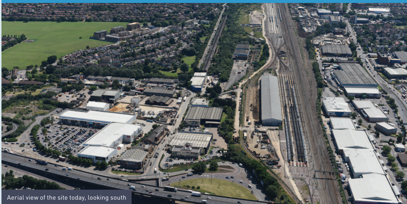
Aerial view of the site today, looking south

New station to be open in 2022 - more information inside Details of upcoming public exhibitions on the back page