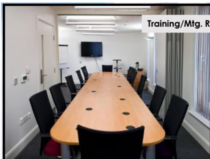
Training/Mtg. Room No. 1 & 2