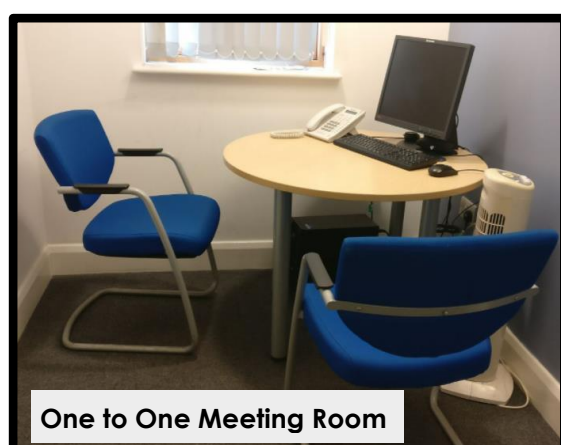
One to One Meeting Room