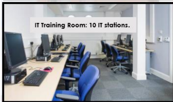
IT Training Room: 10 IT stations.