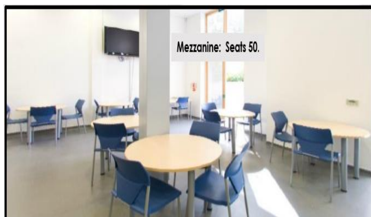
Mezzanine: Seats 50.