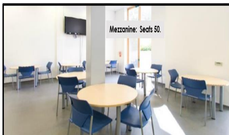
Mezzanine: Seats 50.